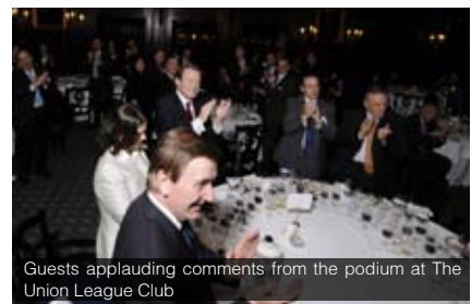
Guests applauding comments from the podium at The Union League Club