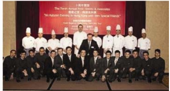
"Twenty-five of the Brigade of the Hyatt Regency Hong Kong, Tsim Sha Tsui that prepared and served the dinner"