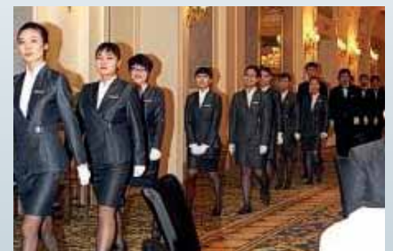
The Parade of the Brigade at the conclusion of the dinner