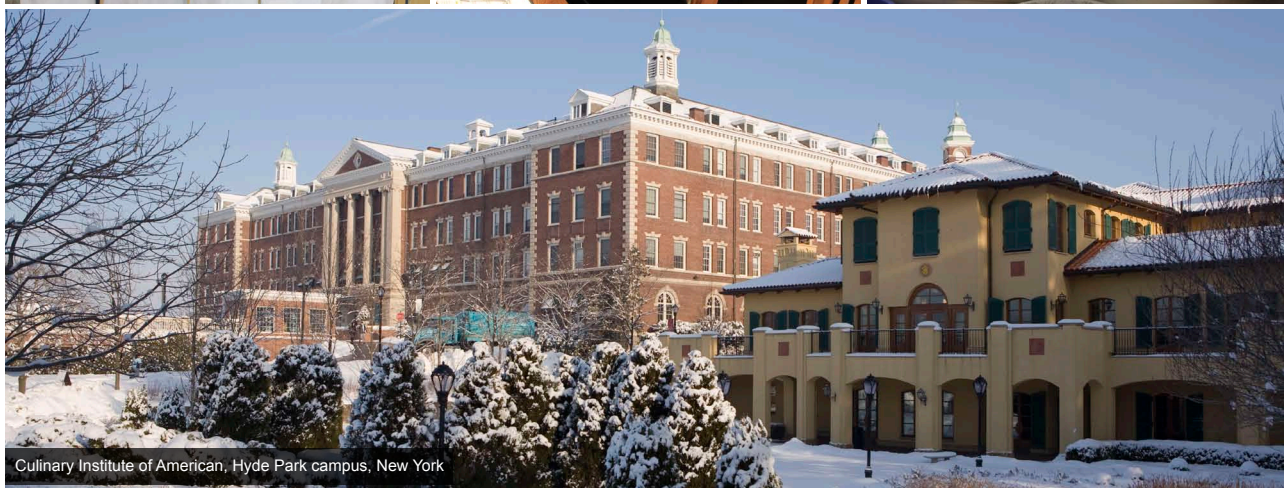
Culinary Institute of American, Hyde Park campus, New York